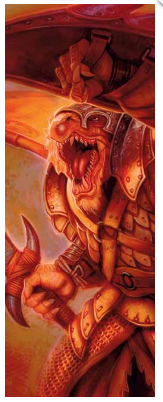
A dragonborn fighter in scale armor

Choose one feat at 1st level. You gain an additional feat at every evennumbered level, plus a feat at 11th and 21st levels.