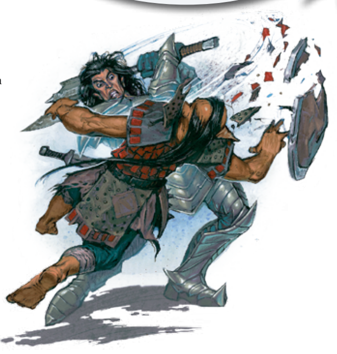
A hobgoblin suffers the brunt of the weaponmaster's wrath

encounter attack power of your level or lower. If you do so, this new power must replace one of the encounter attack powers you already have from your class (usually your lowest-level encounter attack power).