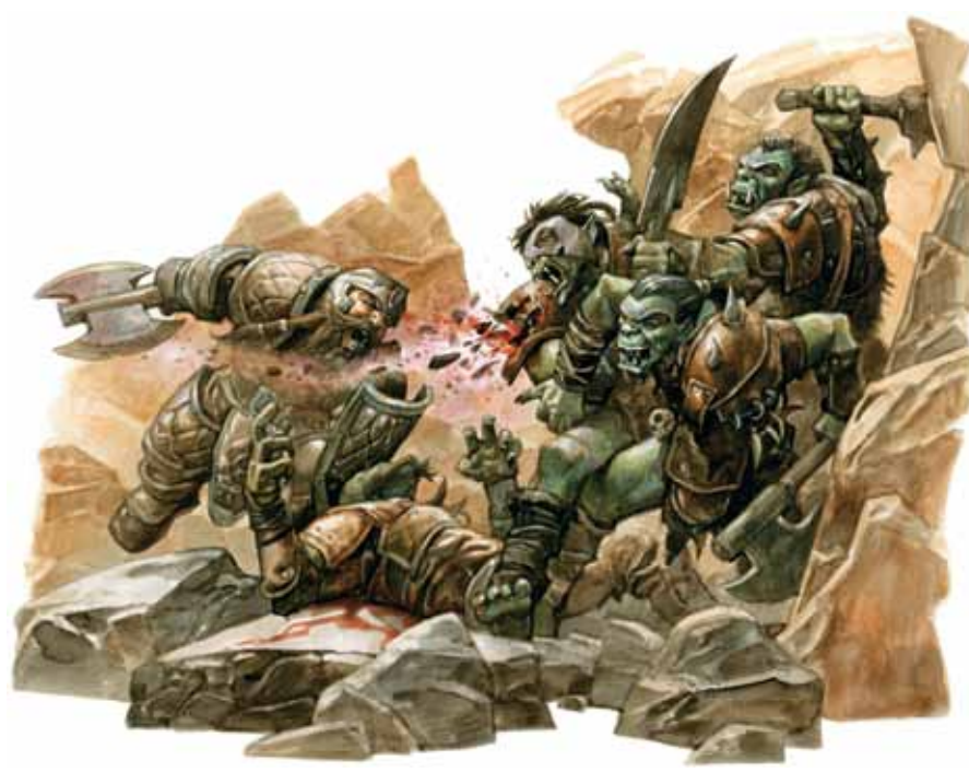
A dwarf fighter unleashes his fury upon an orc war band

Reign of Terror Reign of terror reveals just how terrifying you have become. All it takes is a single strike to draw the attention of every enemy on the battlefield.