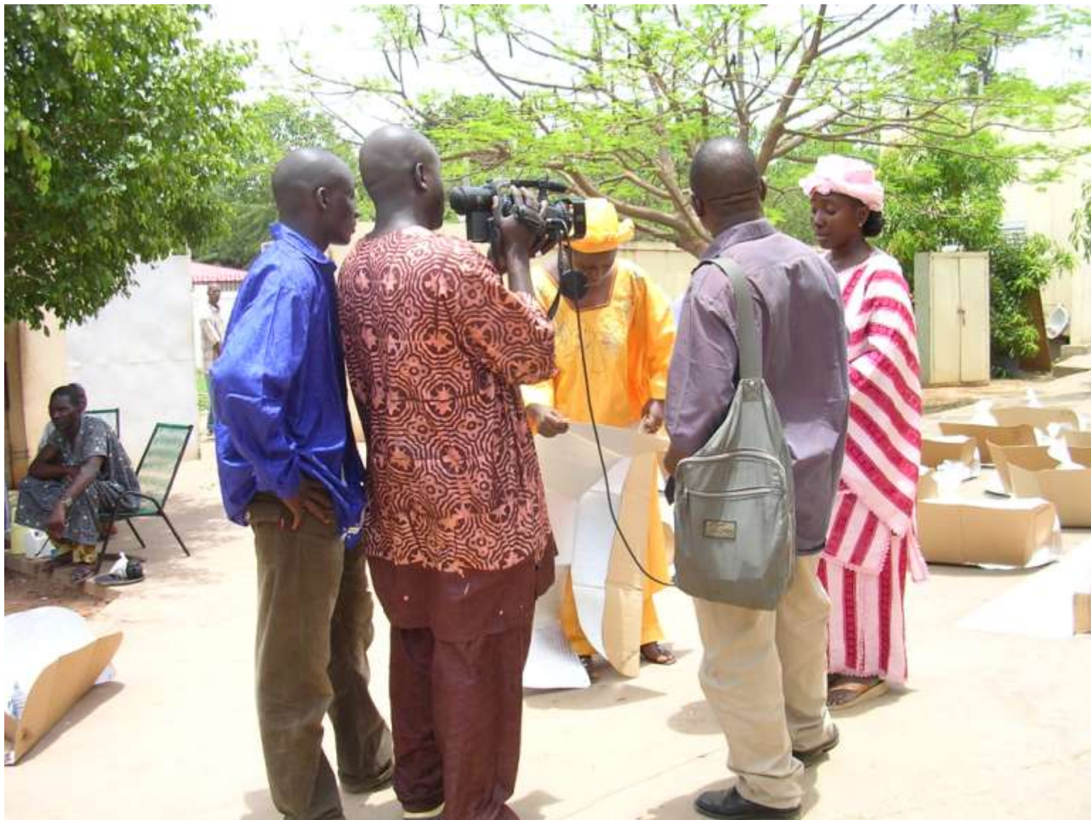
Television team takes video during CookKit demonstration.