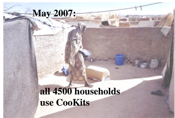
all 4500 households use CooKits

in daytime you find the sun cooking food in CooKits everywhere in Iridimi camp